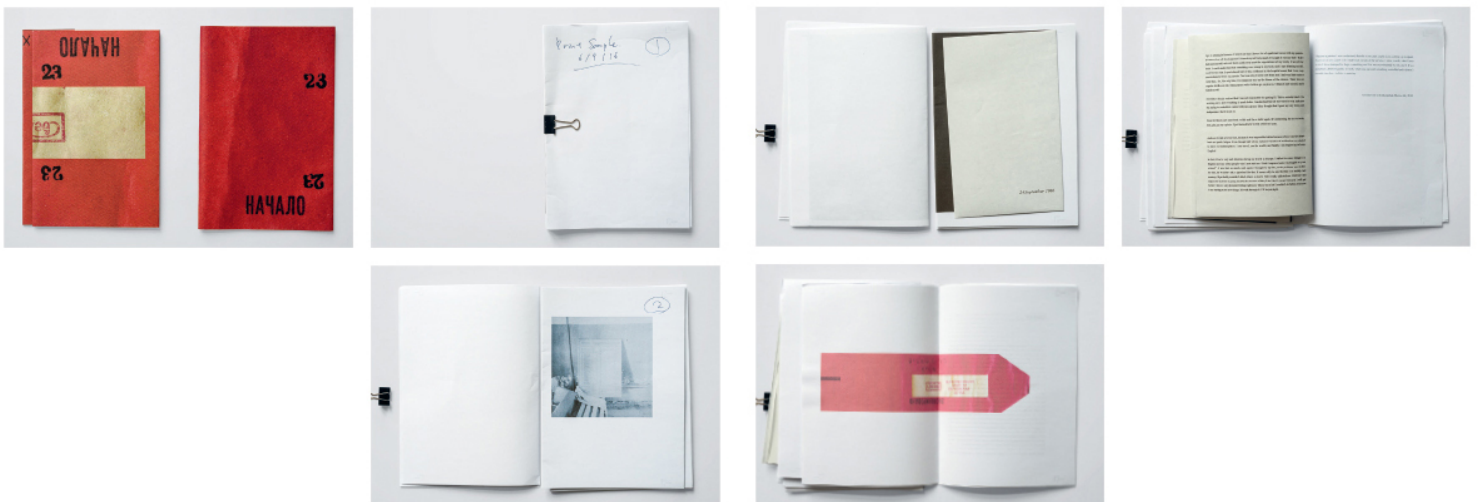
exposure, 14.8 x 21 cm, Dummy by Kazuma Obara

Portfolio with a sequence of 8-12 images from a reportage or a series.