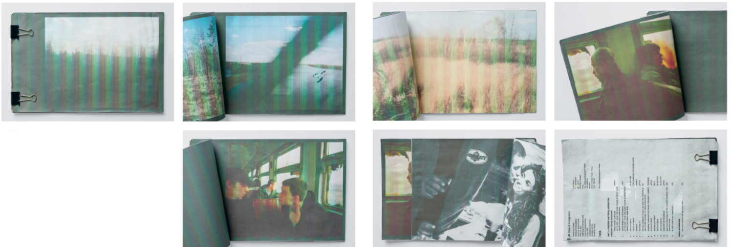
Untitled, 28.7 x 19 cm, Dummy by Kazuma Obara

The Japanese photographer published « 30 » in 2016. It deals with the Chernobyl disaster in 1986. The handmade edition of 86 copies contains the three titles «Exposure», «Everlasting» and «Newspaper».