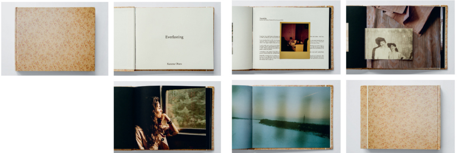
Everlasting, 23.8 x 19 cm, Dummy by Kazuma Obara

Cancellation of a registration (withdrawal) is possible free of charge up to 3 weeks before the beginning of the workshop. In case of a later cancellation, up to 2 weeks before the beginning of the workshop, a cancellation fee of 50% of the workshop costs will be retained. If you cancel later or not at all, you will be charged the full workshop fee. Unless you arrange a substitute participant.